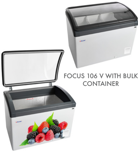
FOCUS 106 V WITH BULK CONTAINER

Cyclopentane is used as blowing agent and the cabinets are CFC free.