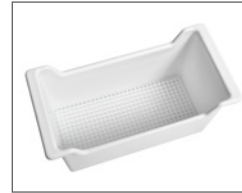
FOOD BUCKET (FDA-APPROVED FOR FOOD)