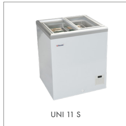
UNI 11 S