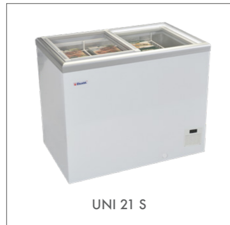
UNI 21 S