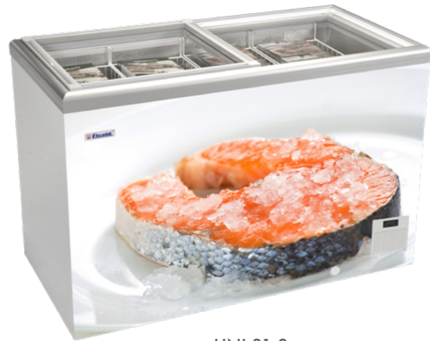
UNI 31 S