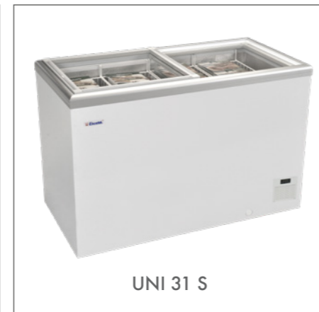
UNI 31 S