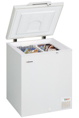
100 MM INSULATION